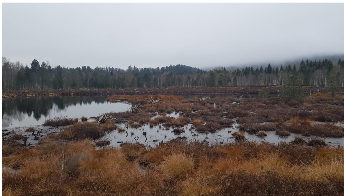
Peatland visited in Les Ponts-de-Martel

Finally, while wetlands are classified as "unproductive vegetation", this thesis invites to redefine the notion of productivity itself with a systemic approach. It emphasizes that the habitability of Earth is due to ecosystems, not to humans, and that ecosystem services are guarantors of human well-being in socio-ecological systems. Nature based Solutions tend to restore them with climate, biodiversity and food sovereignty co-benefits that could allow Switzerland to thrive and appear as a leading example for the ecological transition the world needs.